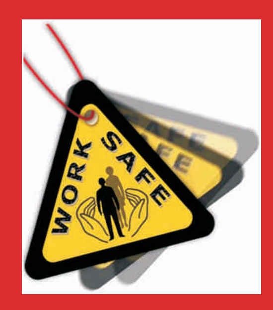
Providing OHSAS 18001 consulting, Training and Certification facilitation services across the world.